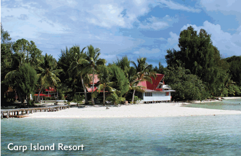
Carp Island Resort